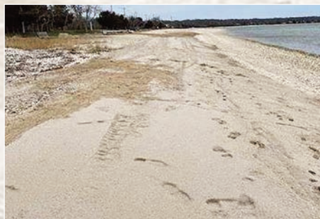
Beautiful Sandy Beach